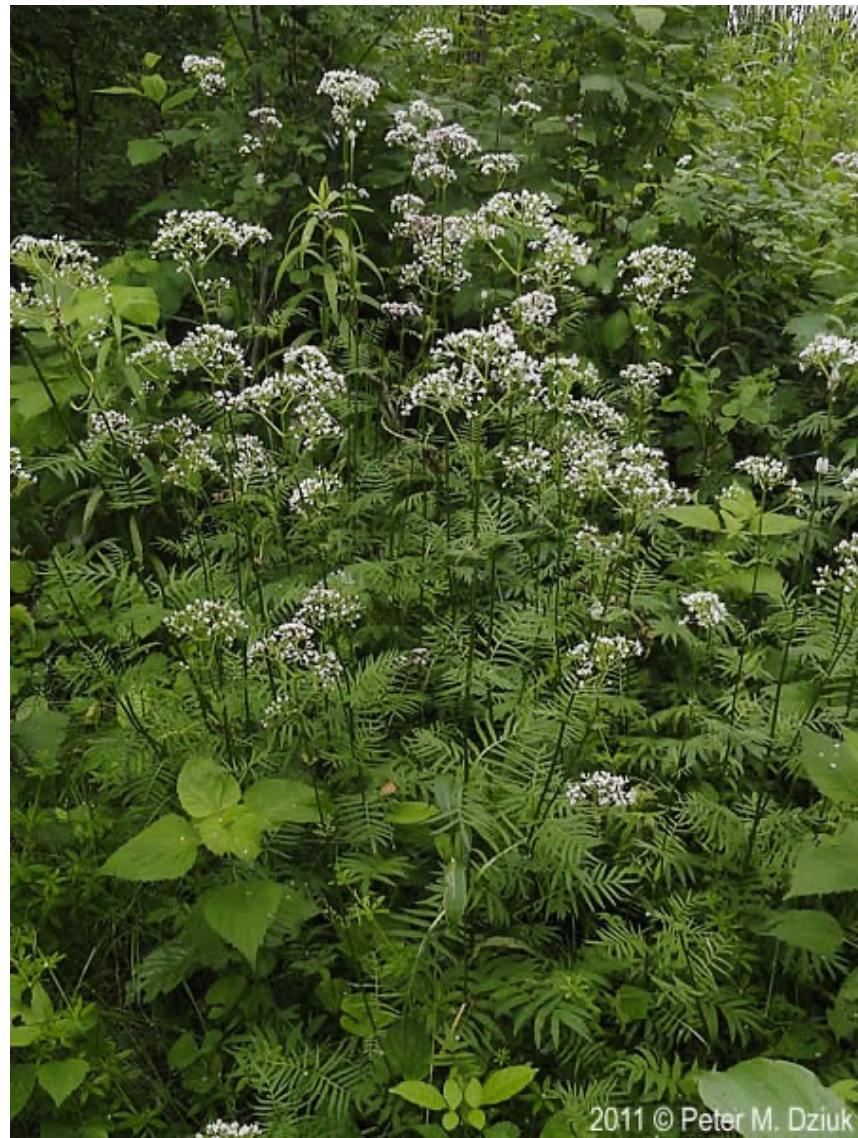
2011 © Peter M. Dziuk