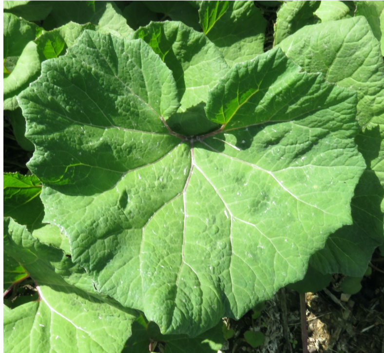
Butterfly dock ( Petasites hybridus ) (I)

Colt's-foot ( Tussilago farfara ) somewhat resembles the invasive butterfly dock ( Petasites hybridus ) and invasive butterbur ( Petasites japonicus ). All three species produce flowers before the leaves, but butterfly dock and butterbur have white or pinkish flower heads borne in clusters . The leaves of both species are green beneath .