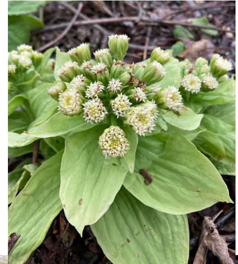
Butterbur ( Petasites japonicus ) (I)