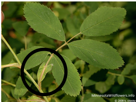
MinnesotaWildflowers.info © 2008 K. chayka