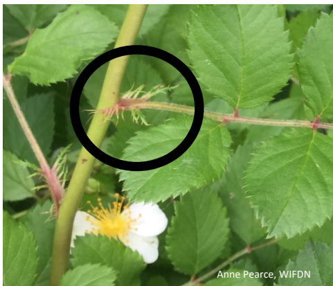
Anne Pearce, WIFDN

Multiflora rose is differentiated from other rose species by its fringed stipules at the base of leaves and numerous, white flowers (native roses have pink flowers). Additionally, multiflora rose's prickles are large and noticeably curved downward ; prickles on other species are generally smaller and stick straight out from the plant or are only slightly curved.