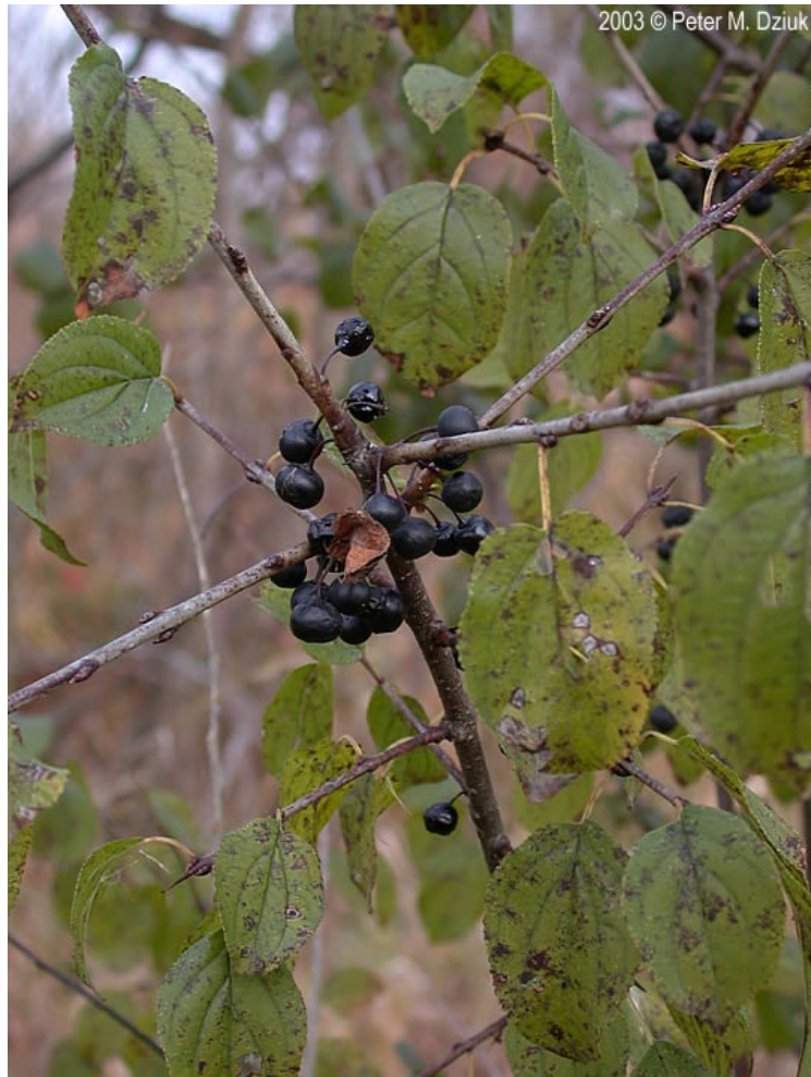
2003 © Peter M. Dziuk