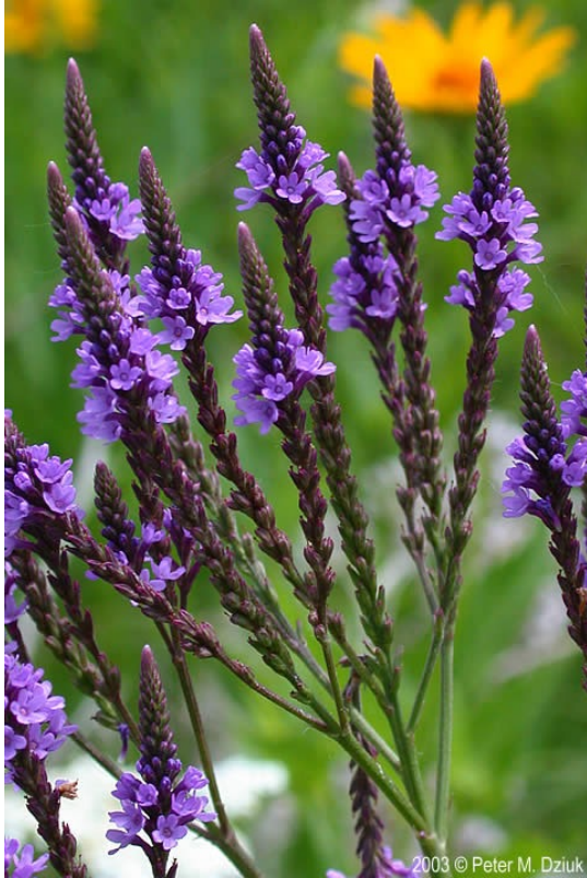
2003 © Peter M. Dziuk

Many wetland and wet prairie plants look like purple loosestrife ( Lythrum salicaria ) including blue vervain ( Verbena hastata ) (N), swamp loosestrife ( Decodon verticillatus ) (N), winged loosestrife ( Lythrum alatum ) (N), fireweed ( Chamaenerion angustifolium ) (N), and blazing-stars ( Liatris spp.) (N).