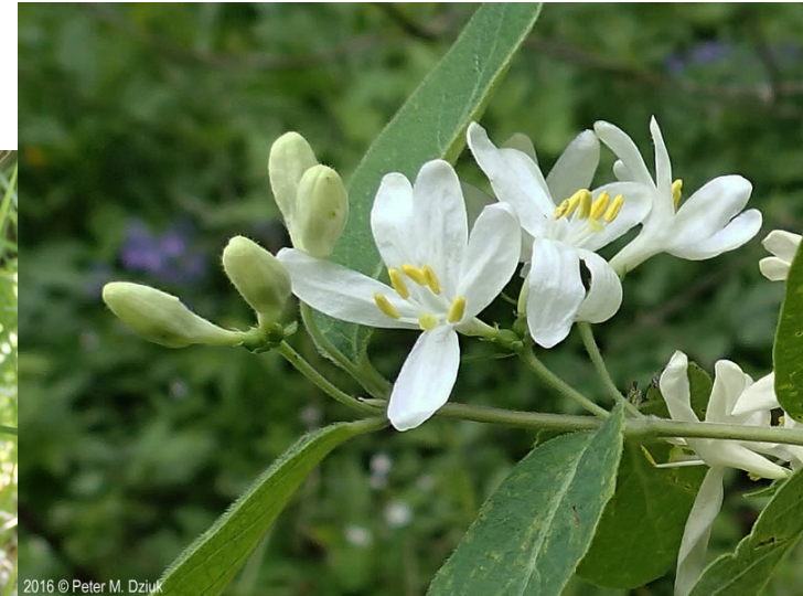
Non-native honeysuckle ( Lonicera sp.)