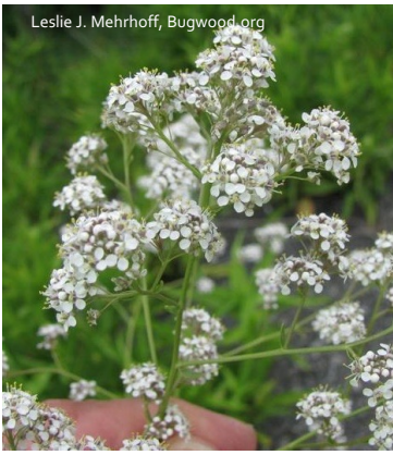
Perennial pepperweed has dense clusters of small white flowers (left) that develop into tiny, hairy, flat pods (right).

Perennial pepperweed ( Lepidium latifolium ) may get confused with other Lepidium species, especially hoary cress ( L. draba ). It can grow much taller than the other Lepidium species and has tiny fruits.