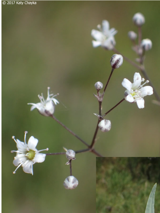
Baby's breath ( Gypsophila paniculata ) (I). Note the five-petaled flowers and opposite leaves .