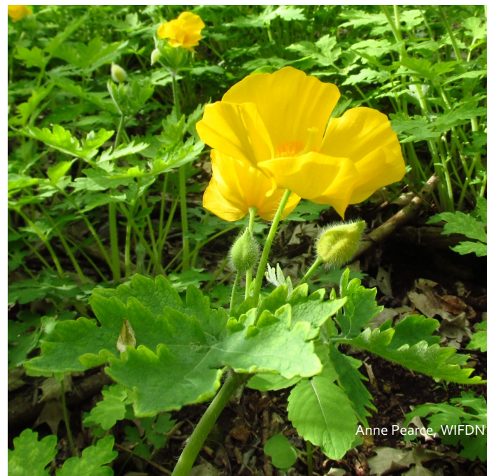
Woodland / celandine poppy