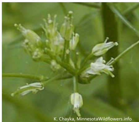
Narrowleaf bittercress has tiny flowers with indistinct petals.

Narrowleaf bittercress ( Cardamine impatiens ) may be confused with other Cardamine species that have pinnately compound basal leaves with rounded leaflets and stem leaves with narrower leaflets, especially Pennsylvania bittercress.