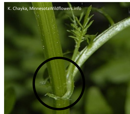
Narrowleaf bittercress has a pair of auricles clasp the stem at the base of each leaf.