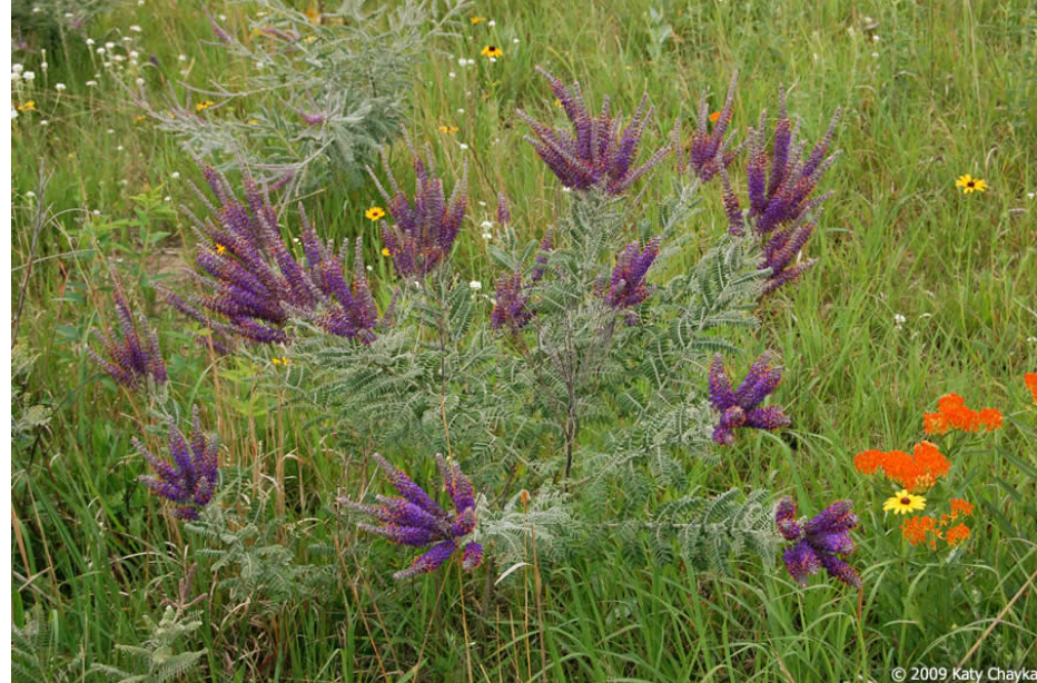
Leadplant ( Amorpha canescens )