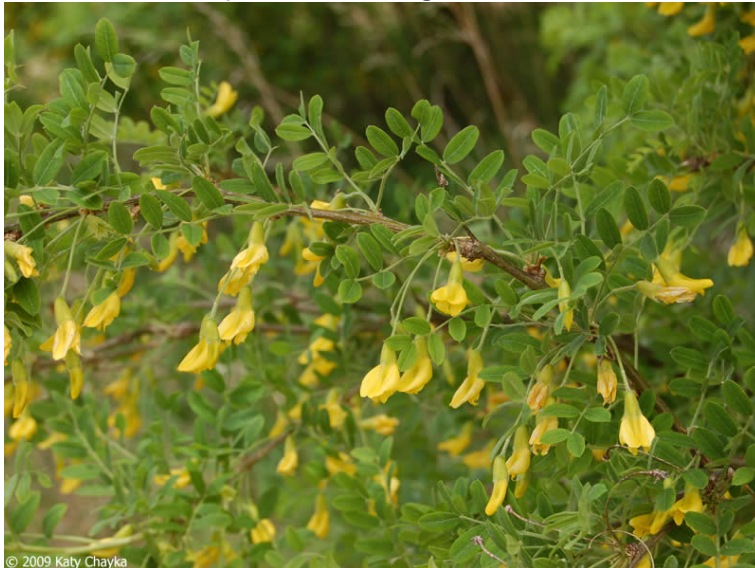
Siberian peashrub ( Caragana arborescens )