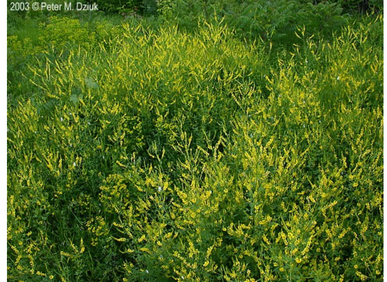
Sweet-clover ( Melilotus officinalis )