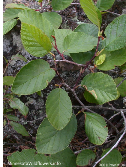
MinnesotaWildflowers.info 2006 © Peter M. Dziuk