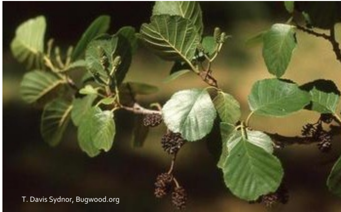
T. Davis Sydnor, Bugwood.org

European alder ( Alnus glutinosa ) may be confused with the native green alder ( Alnus viridis ) and speckled alder ( Alnus incana ).