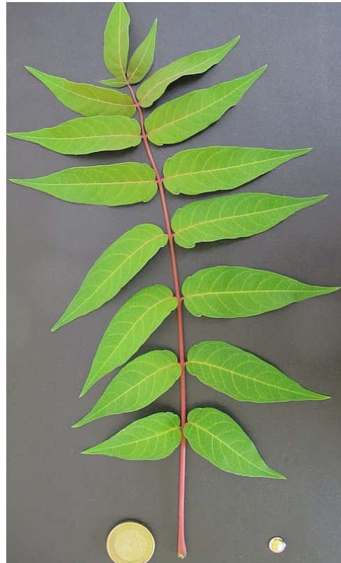
Tree-of-Heaven ( Ailanthus )