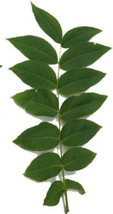
Walnut ( Juglans ) © tree-guide.com