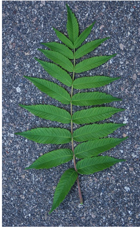
Sumac ( Rhus )